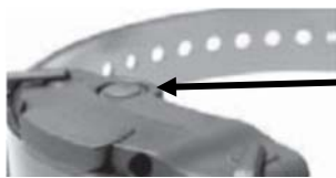
Intensity selection dial of the transmitter